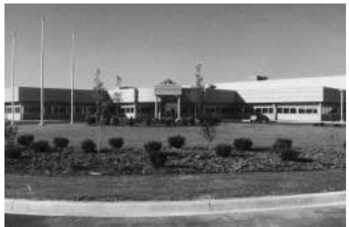
Ube Automotive North America Sarnia Plant, Inc.

■ Continued on page 6... Ube Automotive North America