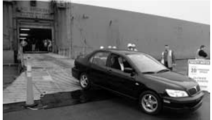
The first Mitsubishi Lancer lands at Fraser Wharves in Vancouver