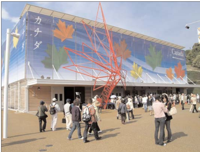
The Canada Pavilion at Expo 2005 in Aichi, Japan.